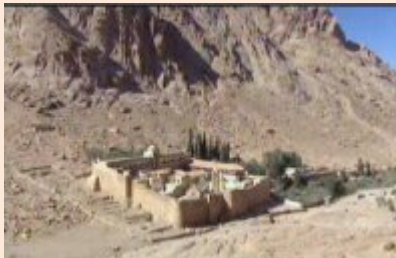
St. Catherine's Monastery

Built to advertise Ramesses' ultimate power, the Temple at Abu Simbel would be the finest rock-cut temple in the world. Gangs of masons were set to work on the facade of the Temple of Ramesses to transform a cliff-face into two enormous statues of the pharaoh. Carved out of the living rock they would be 69ft high. It is thought that the location of the Temple of Ramesses was chosen partly for the suitability of the rock face and also because it was close to the Nile and would be seen, from miles away, by anyone entering Egypt from the south.