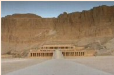
Queen Hatshepsut's Temple

The kings of ancient Egypt were no mere mortals, they were Gods incarnate, and the ancient Egyptians cared more for the burial of their kings than any other nation that has existed. 3,500 years ago they began to build the most revered cemetery on Earth. The Valley of the Kings is the most magnificent burial ground in the world. Sixty two tombs, cut deep into the rock, overflowing with the treasures of ancient Egypt. Pharaohs like Tutankhamun and Ramesses the Great were laid to rest at the Valley of the Kings. The oldest tomb in the Valley of the Kings belonged to King Tutmos and dates back to the 16th century B.C. Most of the tombs in the Valley of the Kings are unfinished, the work being cut short by the king's death. At the Valley of the Kings however the tomb of Seti is virtually complete. The tomb of Seti was unearthed by Giovanni Battista Belzoni in 1817 who was fortunate enough to chance upon the longest and deepest of all the tombs.