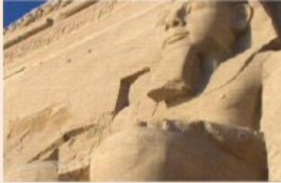
Temple of Ramesses

When Thebes became the religious centre of Egypt, the Karnak temple became the seat of Amun, the state God. Karnak was soon home to over 600 priests. Its buildings spread south and west towards the Nile. At the centre, is a hyper-style hall with a forest of columns, some of which reach 70ft high. The Karnak temple also contains Hatshepsut's obelisk which at 96ft is the largest surviving obelisk standing in Egypt. Weighing 323 tons, Hatshepsut's obelisk is carved from a single piece of granite from 400 miles away at Aswan. Building on a massive scale never daunted the Kings of Ancient Egypt, each one set out to surpass the last.